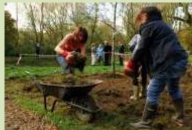
Wallingford Green Gym, Sonning Common Green Gym and Withymead volunteers